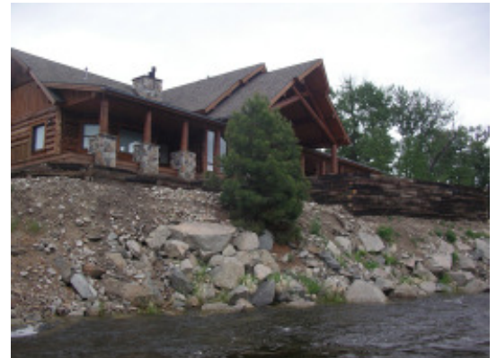
This home on the East Fork of the Bitterroot River in Ravalli County is a good example of building too close to a highly flood-prone river.