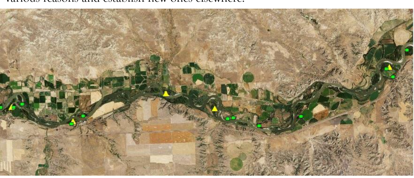
Map showing historical rookeries (green squares), and rookeries found during blind aerial imagery search (yellow triangles) along a portion of the Yellowstone River.

and were immediately able to see which of the rookery locations overlapped and which did not. An overlap of a new and historical rookery meant we found a historical rookery. When a new rookery did not overlap a historical rookery, we knew it had not been previously reported. When a historical rookery did not overlap a new rookery, we had to closely re-examine the imagery to make sure we did not overlook it. After re-examining all of the historical rookeries we potentially missed, we were happy to learn that during our "blind" survey we successfully detected 16 of 17 (94%) of rookeries that were actually detectable on the aerial imagery maps. Since rookeries have a distinctive, easily recognizable appearance, we are fairly confident the majority of historical rookeries we did not find were no longer present where they were originally reported. This is not necessarily a bad thing since Great Blue Heron are known to regularly abandon their rookeries for various reasons and establish new ones elsewhere.