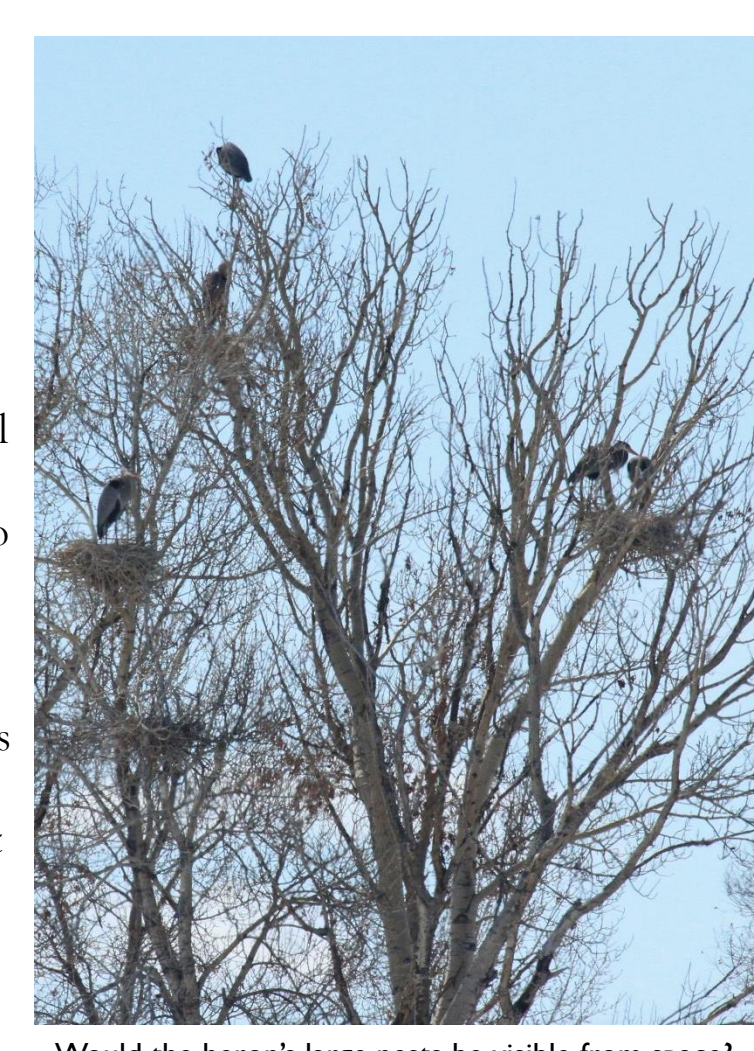
Would the heron's large nests be visible from space?

We first selected five major river stretches designated as Important Bird Areas that have cottonwood galleries: Yellowstone River Lower and Upper Reach, Charles M. Russell NWA, Tongue River, and Clark Fork River-Grass Valley. We then reviewed several known rookeries outside of the search area to become familiar with their visual signature (e.g. their average size, shape, contrast against the background), and to determine the optimal search scale- or zoom level: if we zoomed in too closely it would take much longer to scan the search area, and if the field of vision was too far above the surface, rookeries would not be detectable! We found that scanning from 700-1000 meter above the surface was ideal. We systematically scanned the cottonwoods along these river corridors using the highest resolution images available.