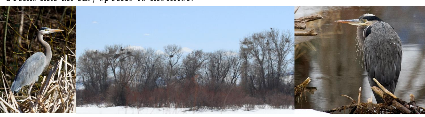
(Left) Great Blue Herons are the largest of Montana's wading birds. (Center) Their rookeries can be visible at a distance in the early spring before leaf-out. (Right) When the air is cool, herons can scrunch up, obscuring their long s-curved neck.

One species that nests in locations that can be hard to survey is the majestic Great Blue Heron. The Great Blue Heron is a species of concern in Montana. Based on Breeding Bird Surveys data we know that heron populations have experienced significant decline of 2.2% per year between 1966 and 2010. In order to gain better understanding of Great Blue Heron population trend, it is important to monitor and protect their nesting colonies. Many observant people have seen a Great Blue Heron nesting colony, or "rookery" at some point. In Montana, herons usually establish rookeries along major waterways, most often in mature cottonwood galleries. Nests are large, usually 3-4 feet across and 1-2 feet deep, and rookeries can have anywhere from a handful to well over 100 nests. Nests are often built high in the canopy, and under good conditions, can be seen from hundreds of yards away. Seems like an easy species to monitor!