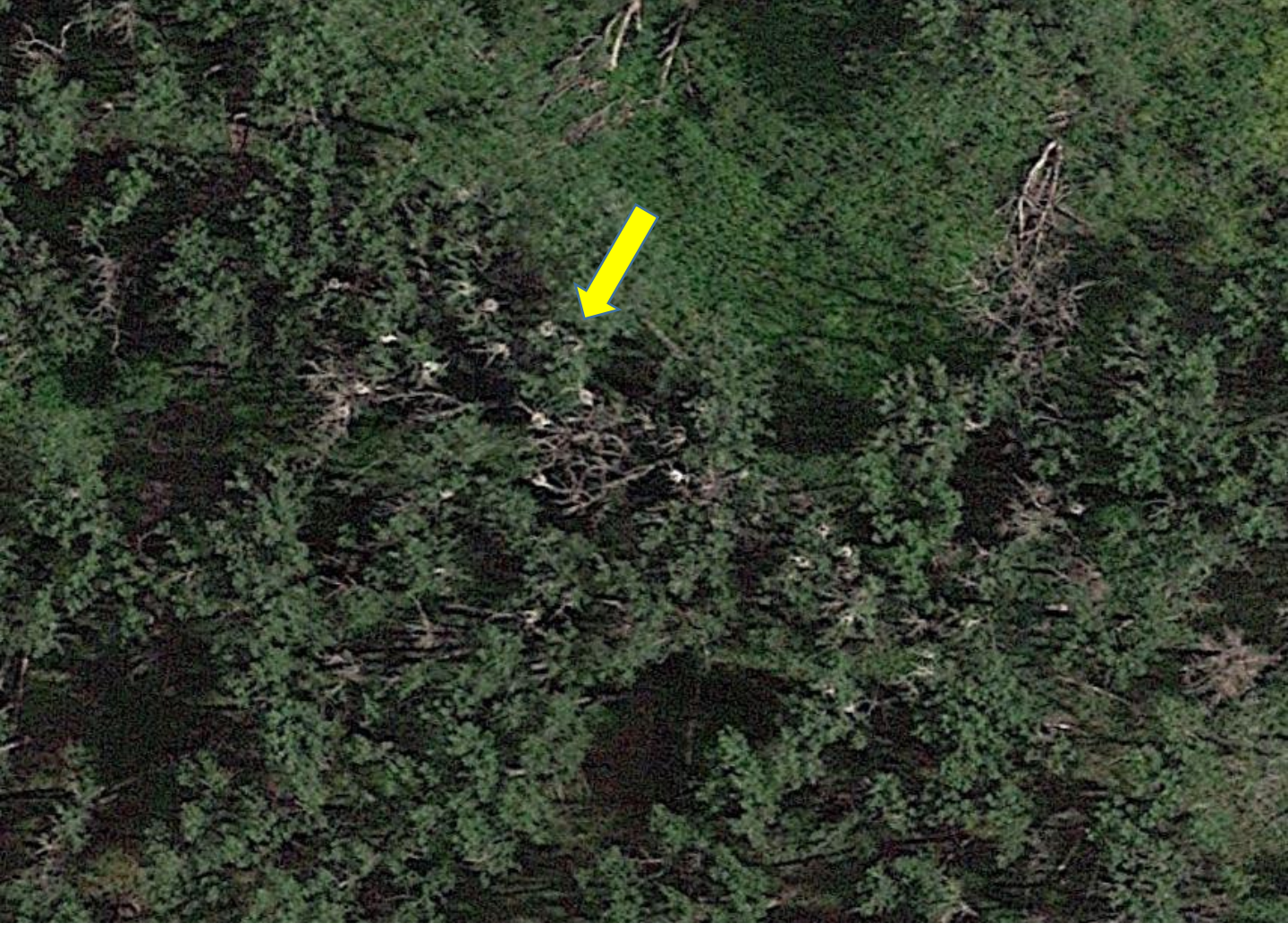
Typical appearance of a rookery on aerial imagery: a cluster of small, round nests visible against a dark green backdrop. We know individual nests are ~3 ft. across, so we are able to precisely measure suspected nests in areas with low quality imagery to make sure they match the known dimensions. This specific rookery is along the Missouri River, within the Charles M. Russell NWA, and has not been previously reported.

We scanned for rookeries "blind"- without knowing the locations of historical rookeries reported over the years. We carefully followed a grid of small 270 x 400 meter cells to ensure thorough coverage. Sure enough, many rookeries were quite easy to detect, and sometimes, by looking at imagery from successive years, it was even possible to see whether a given rookery was growing, shrinking, or being established or abandoned. We could detect these changes because for most rookeries the aerial imagery quality was quite good, allowing us to get precise nest counts each year. Next, we wanted to see how many of the detectable rookeries we were overlooking. This survey method would not be worth pursuing if many existing rookeries were overlooked! We tested our search accuracy by comparing the locations of the rookeries we found during the "blind" search to the locations of known, historical rookeries along the same river corridors. To do this we overlaid a map of historical rookeries with the map of our newly-found rookeries