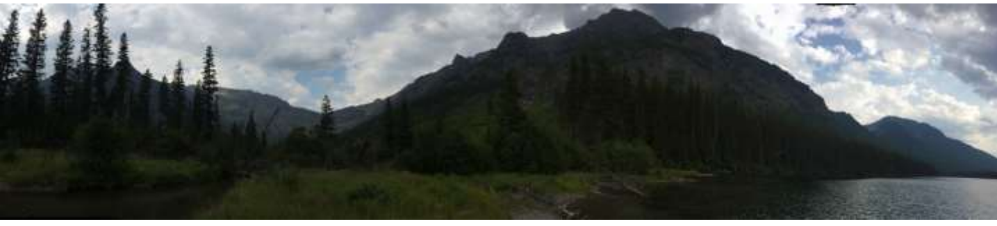
(Above) The head of grace Lake with falls (not visible) present high up near the saddle.