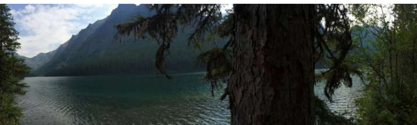
(Above) Grace Lake – above Logging Lake, and one lake closer to the falls.