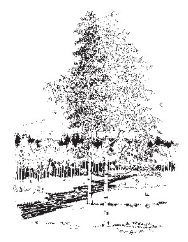
HB 2 - Amendment

dependence on fossils fuels, thereby protecting wildlife habitat from many of the affects of energy development. A vote for the bill is a vote for the Audubon position. The House vote featured is the 2nd Reading vote; it passed 54 - 46.