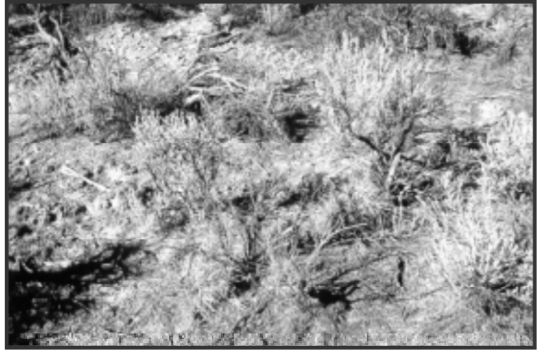
Excessive grazing removes the grasses and forbs between and even under the shrubs. Grazers also trample the soil and occasionally a ground nest.

success. Corrals, feedlots, and watering sites provide feeding sites for cowbirds. Where possible, consider rotating livestock use in order to rest units from cowbird concentrations in alternate years and to give local songbird populations (within a radius of 6.5 km or 4 mi) breeding opportunity without high parasitism pressure.