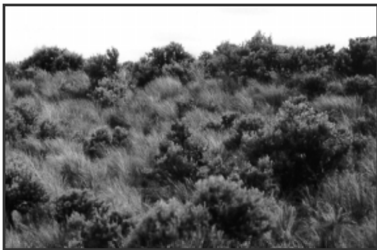
Diane Ronayne, IDFG

Biological soil crust is an integral and usually overlooked component of sagebrush shrublands. It creates a rough crust on the soil surface in semi-arid habitats. Biological soil crust (also known as “cryptobiotic crust,” “microbiotic crust,” or “cryptogamic soil”) is a fragile microfloral community composed of blue-green algae, bacteria,