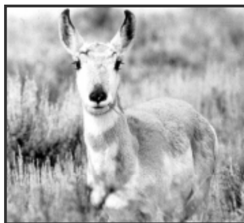
Environmental Science and Research Foundation

shrubs and grasses (Peterson 1995). Pronghorn, pygmy rabbits, and sage grouse may eat exclusively sagebrush in winter, and sagebrush also becomes a major portion of mule deer and elk diets. Taller sagebrush provides cover for mule deer and sage grouse (Dealy et al. 1981), and the crowns of sagebrush break up hard-packed snow, making it easier for animals to forage on the grasses beneath (Peterson 1995). Throughout the rest of the year, sagebrush provides food for pygmy rabbits and sage grouse; protective cover for fawns, calves, rabbits, and grouse broods; and nesting sites for many shrub-nesting birds. The sage thrasher, Brewer's sparrow, sage sparrow, and sage grouse most frequently nest in or beneath sagebrush.