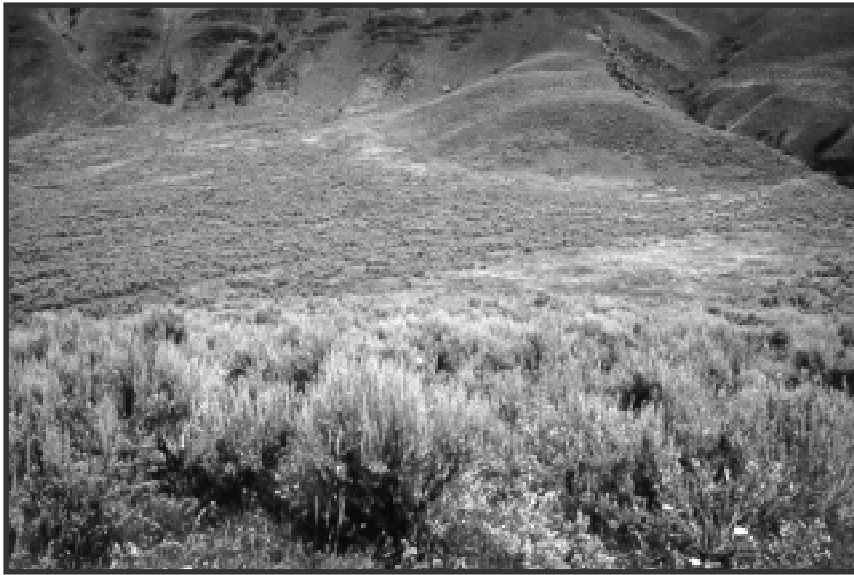
Michael Mancuso, Idaho Conservation Data Center

To many of us, sagebrush country symbolizes the wild, wide-open spaces of the West, populated by scattered herds of cattle and sheep, a few pronghorn antelope, and a loose-knit community of rugged ranchers. When you stand in the midst of the arid western range, dusty gray-green sagebrush stretches to the horizon in a boundless, tranquil sea. Your first impression may be of sameness and lifelessness—a monotony of low shrubs, the over-reaching sky, a scattering of little brown birds darting away through the brush, and that heady, ever-present sage perfume.