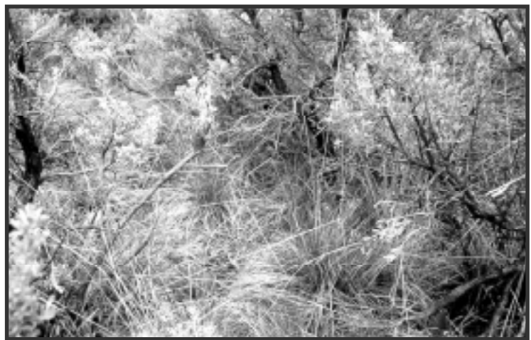
This native grass understory within big sagebrush is excellent nesting cover for sage grouse and other ground-nesting species. These birds use native grasses and forbs to construct their nests, shade them, and hide them from predators.