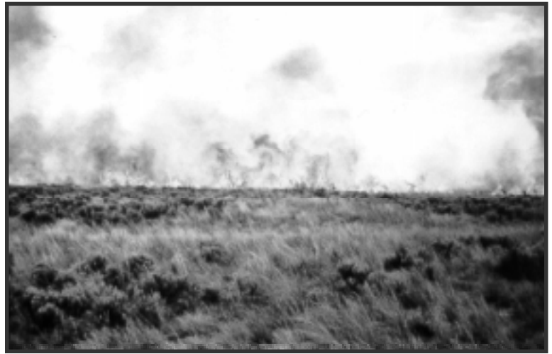
Fire was, and still is, an important part of the sagebrush shrubland ecosystem. Part of the mosaic pattern in sagebrush is due to fires, which tend to burn in patches, creating stands of sagebrush of varying ages.

After a fire, big sagebrush must be re-established by wind-dispersed seed or seeds in the soil. Most sagebrush seeds fall within 1 m (3 ft) of the shrub