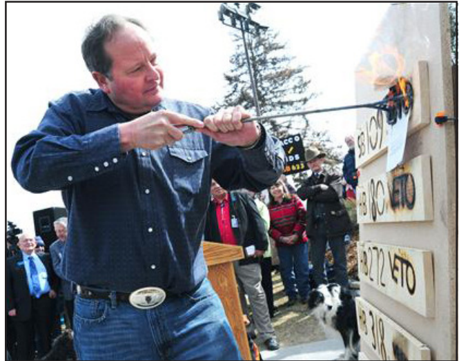
Governor Brian Schweitzer vetoed more than 100 bills during the 2001 Montana Legislature. Here he is shown at a veto ceremony where 17 bills were 'branded.'

Status: Passed both Houses, Filed with Secretary of State.