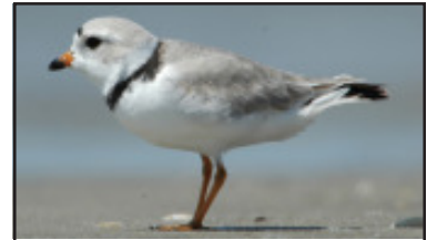
Piping Plover are Threatened under the Endangered Species Act.

To learn more about MT Audubon's efforts at the 2011 Legislature, visit our website or contact Janet Ellis at jellis@mtaudubon.org or 406.443.3949.