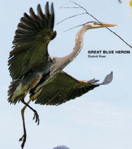
GREAT BLUE HERON Elizabeth Moore