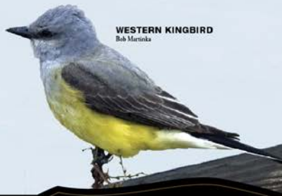
WESTERN KINGBIRD