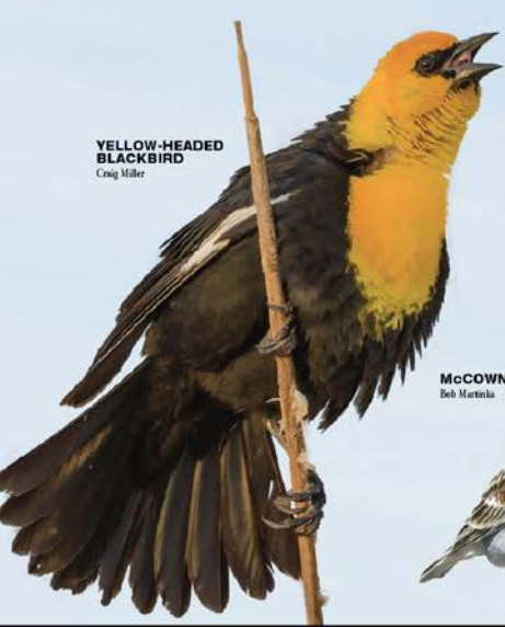
YELLOW-HEADED BLACKBIRD Craig Miller