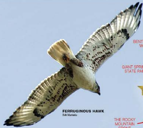
FERRUGINOUS HAWK