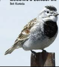
MCCOWN'S LONGSPUR