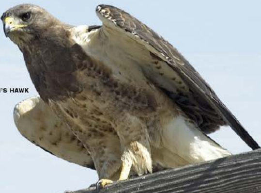
SWAINSON'S HAWK